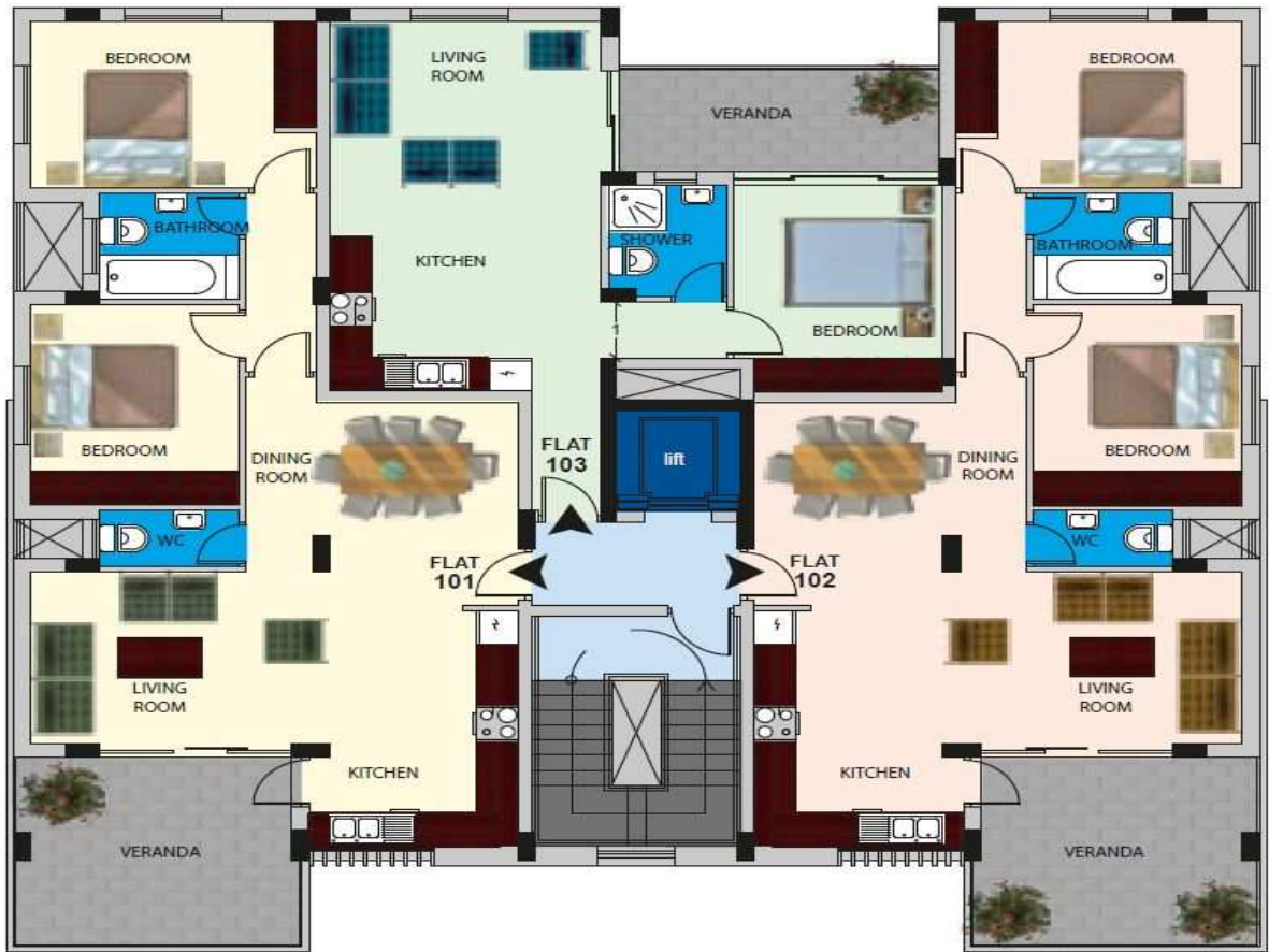
typical floor plan