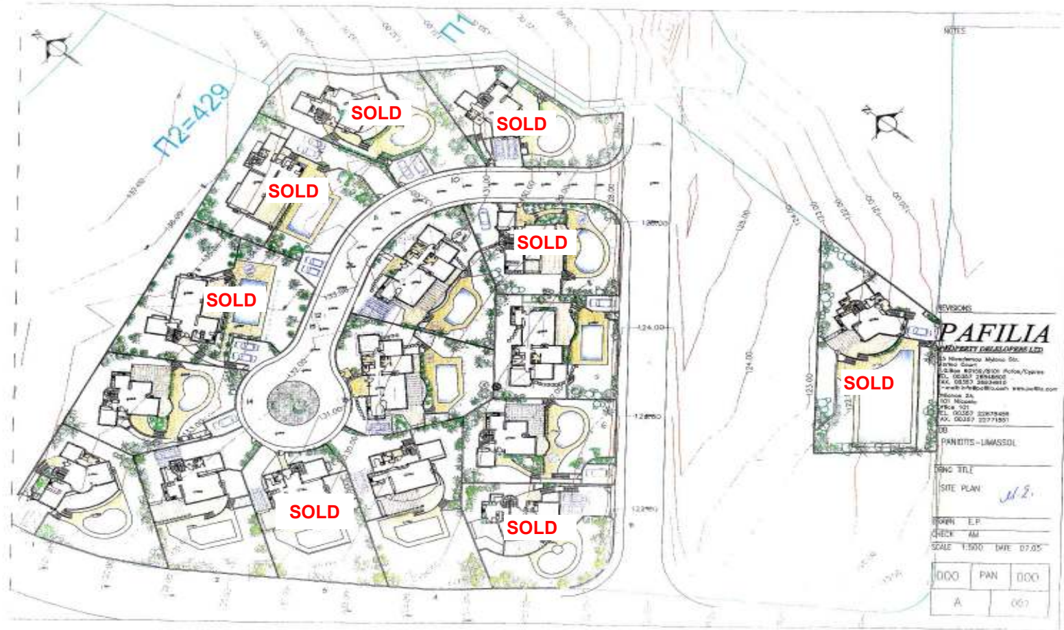
Platinum Collection - Panorama Villas